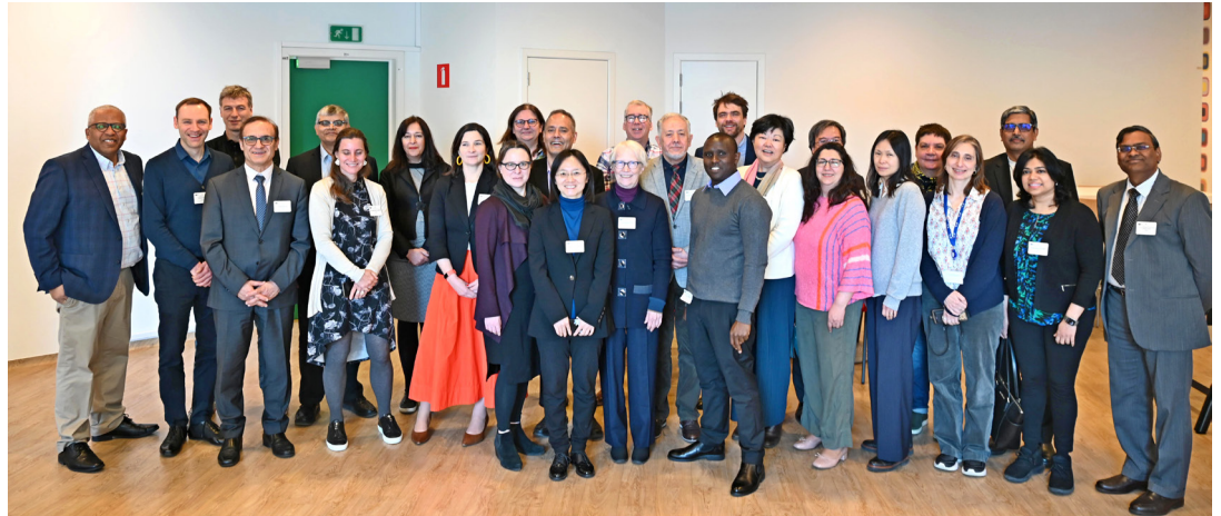
WASP 5th Annual Meeting Group