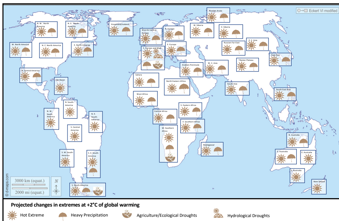
Figure 2: Projected changes of extreme events at +2°C of global warming. Projections are shown for the pre-industrial baseline 1850-1900. Only projected changes with a high level of confidence are represented. Source: AR6 WG1 IPCC report, chapter 11, table A.11.2, pp 17-19. 7

However, there is a great disparity in risk knowledge and response capacity among countries and regions in terms of responding to both sudden-onset and slow-onset events, as well as cascading risks. Knowledge needs to go beyond the provision of extreme weather, climate and water-related alerts to include information about trends in events, locations of climate hazards, types of associated impacts, who and what are likely to be affected, and how to be prepared.