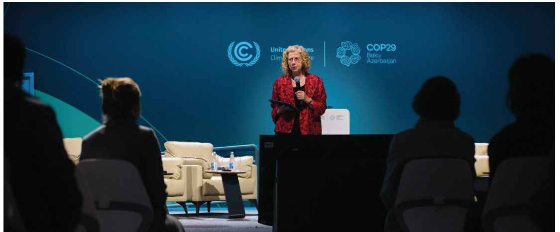
UNEP Executive Director, Inger Andersen, providing remarks about the Adaptation Gap Report during a high-level event at the UNFCCC COP29 in Baku, Azerbaijan.