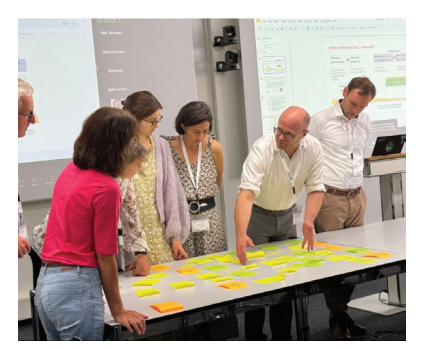
ISSI WASP-ESA Forum in Bern.

The main objectives of the forum were to discuss current methods and capabilities of Earth Observation (EO) to support adaptation planning and monitoring. The Forum will collect in a white paper the status of research and development (R&D) for using EO to support climate change adaptation. Forum deliberations aimed to develop a list of EO metrics of Essential Climate Variables (ECVs) that can help to support the ongoing discussions around the Global Goal on Adaptation. Knowledge gaps that require filling to further enhance EO adaptation R&D were also be explored.